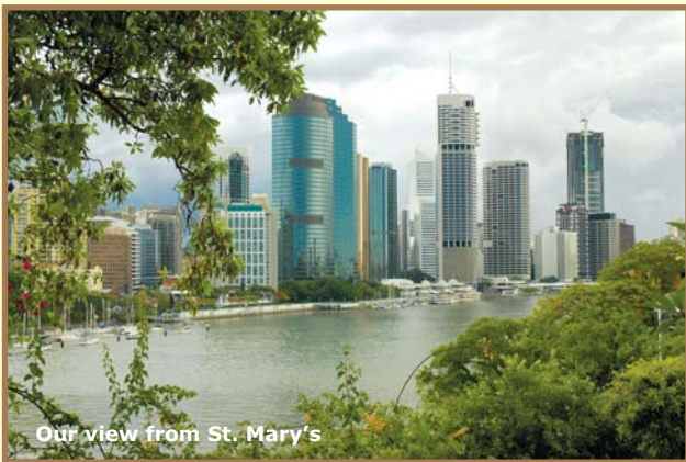
Our view from St. Mary's